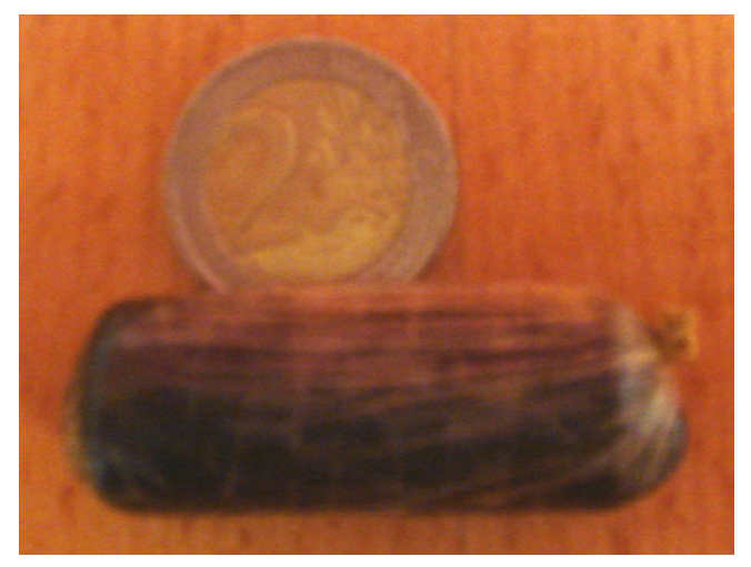
Figure 2 Photograph demonstrating thick wall of a capsule with white substance (found subsequently to be cocaine paste) within.

When surgical extraction is necessary the focus must be on removing all packets. One surgical review of the topic recommends that a single enterotomy is usually sufficient to do this as the packages can usually be "milked" to the enterotomy site and evacuated manually [3]. The tough exterior coat on type VI packages facilitates their milking along the gastrointestinal tract without the risk of rupture seen with types I, II and III. Other reports however warn that wide dispersion of packets in the gut may make intraoperative detection difficult and suggests that multiple