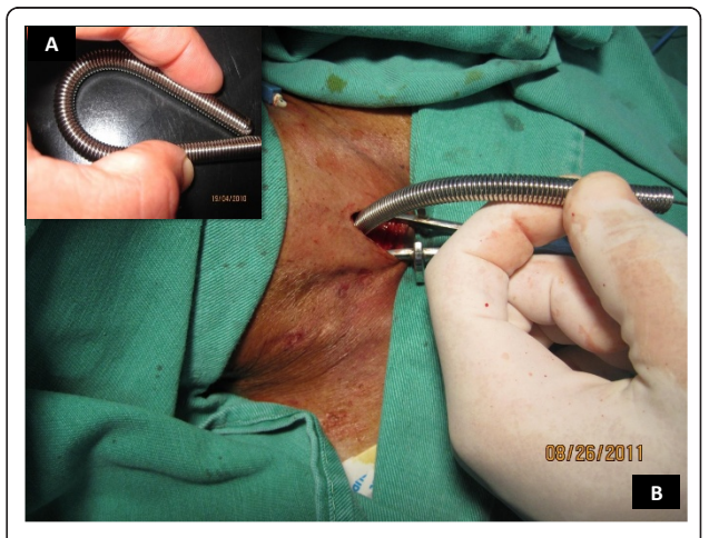
Figure 6 The spherical tip flexible introducer . Insert (A) depicts the elastic property of the introducer constructed with a circular helical spring. Picture (B) shows the flexible introducer positioned in the trachea facilitated by the self-retaining retractor.