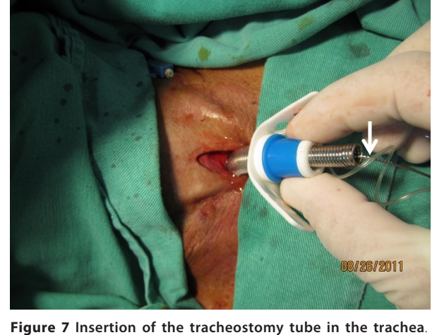
Figure 7 Insertion of the tracheostomy tube in the trachea. Picture shows the insertion of the tracheostomy tube in the trachea over the spherical tip flexible introducer. Arrow depicts the quidewire inside the introducer.

The second feature is the capability to maintain hands-free retraction of the pre-tracheal soft tissue, and the tracheal aperture, with the self retaining retractor. The device enables controlled lateral dilation of the tracheal breach up to 2 cm maximum, thereby preventing excessive dilatation. Interestingly, a safety evaluation study in adult cadavers demonstrated that the mean force required to dilate the trachea 1.5 to 2 cm with a Griggs forceps, was two times that for therapeutic tracheal dilatation and three times the force required for tracheal disruption (31.6 N vs. 97.7 N), respectively [26]. The strategic location of the limiter ridge on the retractor (1.5 cm from the tip) is an additional safety feature