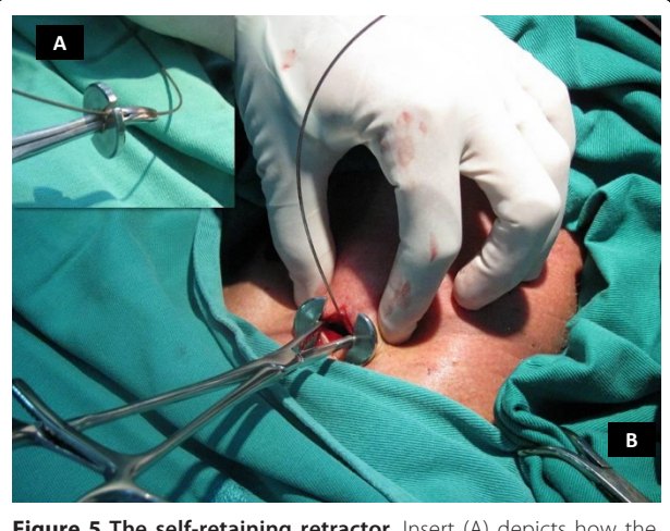
Figure 5 The self-retaining retractor . Insert (A) depicts how the self-retaining retractor is passed over the guidewire in locked position. Picture (B) shows how the retractor enables hands free lateral retraction of the pre-tracheal soft tissue, and the aperture on the anterior tracheal wall. The limiter ridge prevents insertion of the retractor too far into the trachea.

tracheal orifice open (Figure 5). A flexible, spherical tip introducer (6 mm internal diameter) is inserted into the airway under direct vision, facilitated by the retractor which is removed afterwards (Figure 6). A tracheostomy tube is placed inside the trachea passing over the guidewire and the flexible introducer (Figure 7). At this point the flexible introducer and the guidewire are removed, the cuff is inflated, and the patient is ventilated via the tracheostomy tube. The endotracheal tube is completely removed after adequate ventilation is confirmed by endexpiratory volume on the ventilator and auscultation of the patient. The tracheostomy cannula is secured in place with a neckband, and a chest radiograph is performed. Statistical analysis was performed using Graph Pad Prism (GraphPad Prism Software, Inc., San Diego,