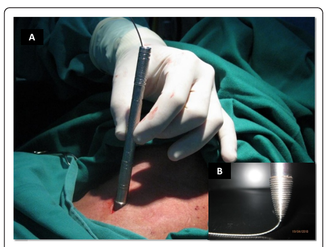
Figure 4 The threaded tip dilator . Picture (A) shows the threaded tip dilator in the incision. Insert (B) depicts how the guidewire, passing through the tip of the threaded dilator, prevents the threads from "catching" other structures.

During the study period, 100 patients underwent percutaneous tracheostomy by the modified technique described in this study. All percutaneous tracheostomies were performed on intubated patients at the bedside. Ninety patients (90%) underwent the procedure in the ICU. The remaining 10 patients were in another hospital location: 4 patients were in the hospital step-down unit, 3 in the trauma room, and 3 in the post-anesthesia