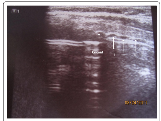
Figure 2 Ultrasound image of the trachea . Longitudinal view of the trachea shows the cricoid cartilage and the tracheal rings; important anatomical references to localize the site of puncture of the trachea. The endotracheal tube has been pulled back. I, II, III (first, second, and third tracheal rings); image obtained with an 8 MHz vascular probe.