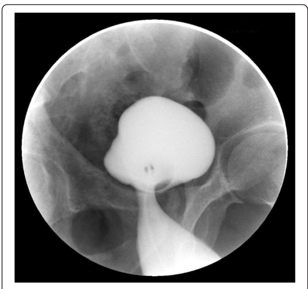
Figure 2 Oblique view of the urinary bladder and the diverticulum.

rolled plug mesh placement. During closure of the wound, a bulge was noticed in the right inguinal area. By palpation, it was proved to be reducible right inguinal hernia. Extension of the pfannenstiel incision to the right side, inguinal canal approached anteriorly opened, indirect inguinal hernia was found, hernia sac was dissected and excised. Hernia was repaired using a tensio and on free mesh technique. Prophylactic antibiotic (ceftriaxone) was given for 3 days. Foley's catheter removed after 4 days and the patient was discharged.