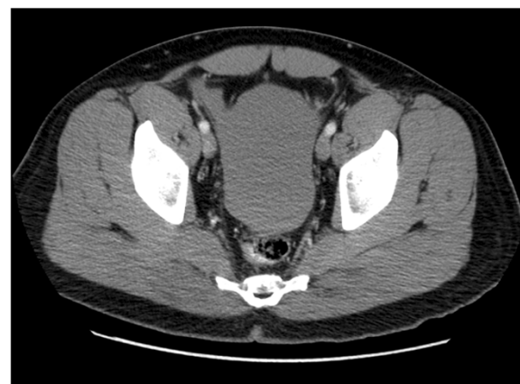
Figure 3 Axial, contrast-enhanced CT image of the pelvis demonstrates large hemoperitoneum.

splenic hematoma at the tip of the spleen tracking anteriorly with interim resolution of free fluid in the pelvis, confirming a splenic etiology for hemoperitoneum (Figure 4). Although the patient's CT scan did not show a blush suggestive of a pseudoaneurysm, the diagnosis