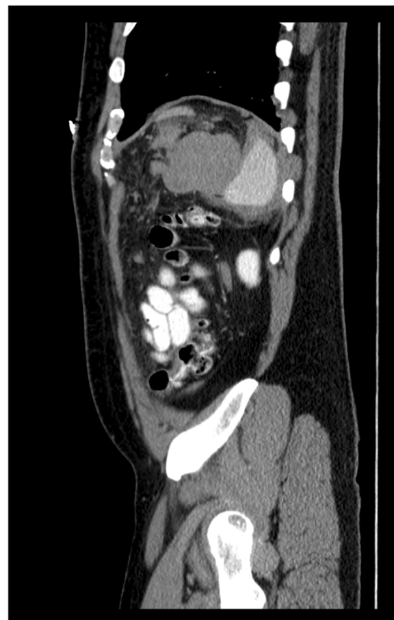
Figure 2 Sagittal, contrast-enhanced CT image demonstrates perisplenic hematoma.

splenic hematoma at the tip of the spleen tracking anteriorly with interim resolution of free fluid in the pelvis, confirming a splenic etiology for hemoperitoneum (Figure 4). Although the patient's CT scan did not show a blush suggestive of a pseudoaneurysm, the diagnosis