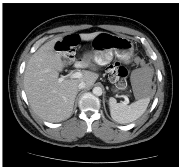
Figure 1 Axial, contrast-enhanced CT image demonstrates moderate hemoperitoneum in left upper quadrant centered around the spleen.

On follow-up ten days after initial presentation, the patient's symptoms had resolved and his vital signs were stable. An abdominal ultrasound revealed a subcapsular