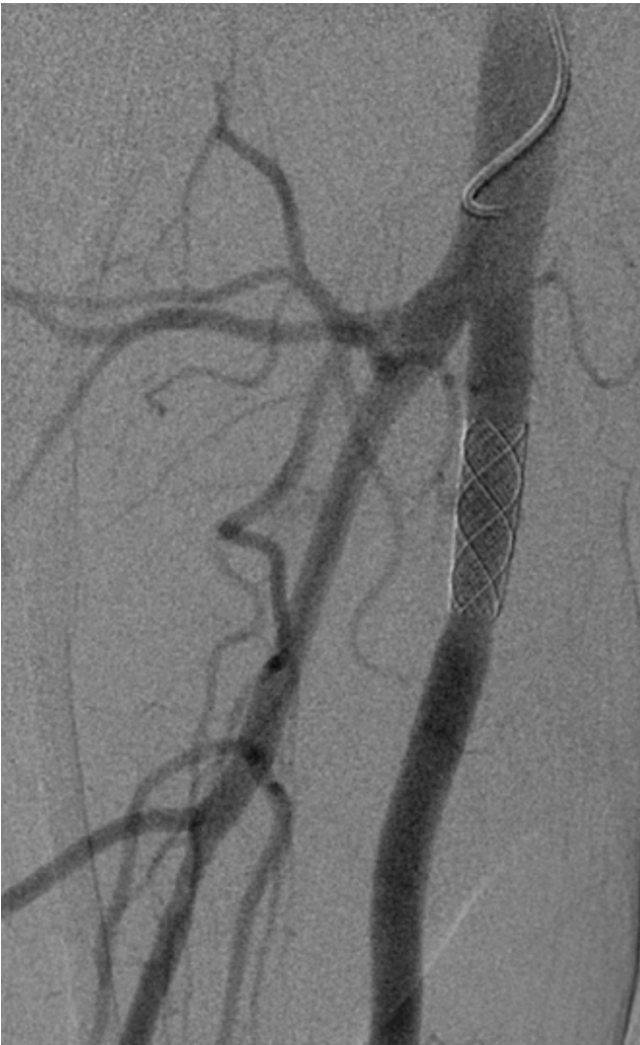
Figure 4 Complete exclusion of arterio-venous fistula following endovascular repair.