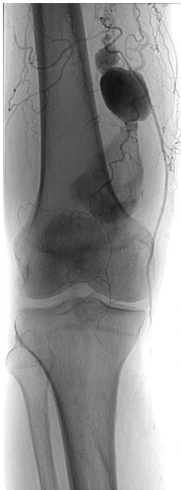
Figure 1 Popliteal artery aneurysm.

Endovascular stenting can also be used in treating arterio-venous fistulas/malformations and pseudoaneurysms in elective and emergency setting. This can be done by using covered stents or by coil embolization. There are many case reports in which it has been used to treat femoral [11,12], popliteal [13,14], tibial pseudoaneurysms [15,16] and arterio-venous malformations [17,18]. In our experience this is a safe, minimally-invasive intervention which ensures an early return to work and a minimal hospital stay [19]. The importance of endovascular stenting is quite significant in patients who develop pseudoaneurysms following orthopaedic procedures like total or partial knee replacement or during knee arthroplasty. These can present in both emergency and elective settings. Because of the hostile operative field, the endovascular approach offers a quick fix to the problem. Both covered