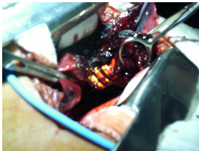
Figure 3 Intra-operative finding. Intra-operative photograph depicts the AM-403/P attenuated energy projectile within the lung parenchyma during wedge resection.

scan of the chest demonstrated a foreign body in the right hemithorax with the form of an AM-403/P attenuated energy projectile (Figure 2). Due to septic complications and the size of the foreign body, the patient underwent a right thoracotomy which revealed a 19 g (6.5 × 2.5 cm) projectile within the middle lobe, which was surrounded by an intra-parenchymal hematoma (Figure 3). The projectile and injured parenchyma were removed by wedge resection. The patient had an uneventful hospital stay and was discharged home 5 days later.