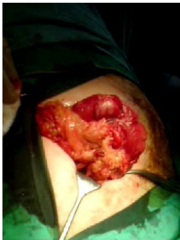
Figure 4 The perforation was oversewn and omentum was used to cover the defect on the caecum.

thought [1]. Perforation of caecum is an uncommon differential diagnosis for an acute appendicitis. Other possible causes of caecum perforation include perforated right diverticulitis [2,3], caecal tumor, and rarely associated with foreign body [4,5], in burn patient [6], tuberculosis infection [7] and following caesarean section [8,9] or iatrogenic endoscopic procedure had been reported. Surgery for colonic perforation is associated with high morbidity and mortality rates.