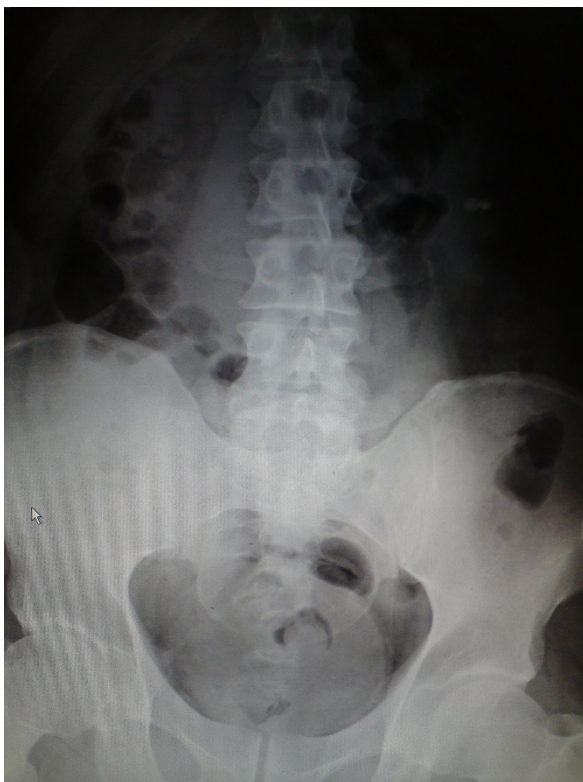
Figure 1 Normal plain film of the abdomen.

Appendicitis perforations, commonly occur at the tip of the appendix, are associated with the presence of a faecolith on CT scan and not the anatomical location of the appendix (retrocaecal appendix) as previously