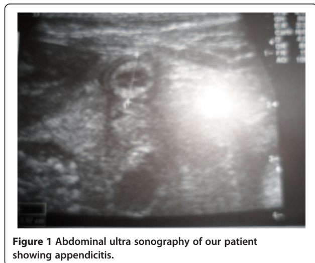
Figure 1 Abdominal ultra sonography of our patient showing appendicitis.