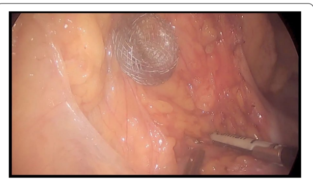
Fig. 1 Misdeployment: view of the EC-LAMS opened on the posterior gastric wall

Establishing gastrointestinal anastomoses is a relatively new endoscopic procedure implemented in 2012 by Binmoeller and Itoi et al. using covered doubleanchored metal stents placed via endoscopic ultrasound guidance [6, 7], it rapidly achieved acceptance as a valued alternative for SGE as it was proven to be effective, less invasive and associated with less procedurerelated morbidity and mortality. Since 2012, foremost case reports or small case series have been published. Recently, two randomized controlled trials comparing endoscopic vs. surgical GE were published [8, 9] A study by Perez-Miranda et al. study of Perez-Miranda et al. showed that endoscopic GE was associated with fewer postoperative complications and higher technical success than surgical GE (differences non-statistically significant). In a study by Kashab et al. no significant