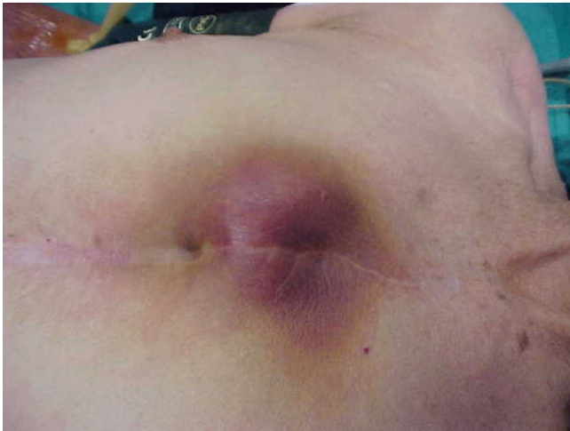
Figure 1 Patient's antero-lateral view showing pulsatile erythematous swelling over the upper third of the sternum.

A preoperative TEE showed a pseudoaneurysm with high flow velocity inside, developed between the prosthesis and the posterior surface of the sternum.