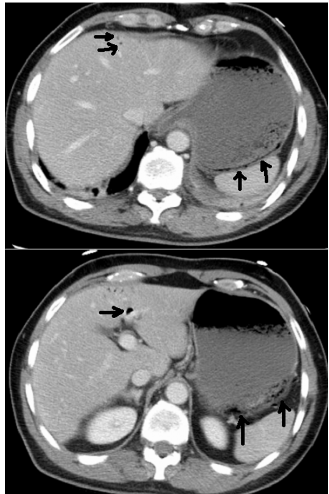
Figure 1 Portal gas within the liver secondary to partial necrosis of the gastric wall.

Respiratory tract infection, abdominal trauma, diagnostic and therapeutic gastrointestinal procedures, resuscitation procedures, drugs and caustics ingestion are rare causes for PVG, while it is idiopathic in certain cases [36-44] (see additional file 1).