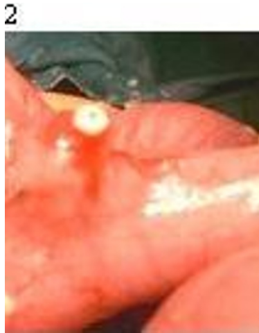
Figure 2 Perforation at tip of Meckel's diverticulum through which worms escape into peritoneal cavity.

most common complication seen in the children [6]. Mode of intestinal obstruction involves mechanical obstruction, intussusception or volvulus of small gut. Mechanical obstruction is the most frequent mode of small gut obstruction and is due to bolus of worms (Fig 3A, B & Fig 4A, B, C). Ascariidial intestinal obstruction can be manifested as partial or the complete type of small gut obstruction. In children, abdominal pain, vomiting and abdominal distension are usually present. There can be diarrhea, constipation, passage of worms with stools as well as with vomitus.