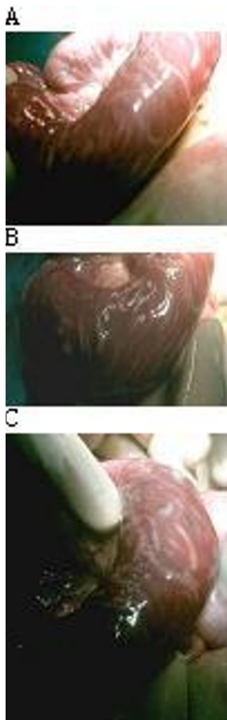
Figure 4 A & B Showing of impacted long worm bolus with transerosal visibility. C. Showing of impacted worm bolus with gangrene of distal small gut due to mechanical obstruction.

done when multiple impacted worm boluses widely apart in small gut are present.