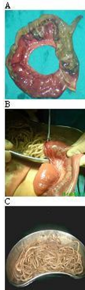
Figure 1 Demonstration of ileum with its located Meckel's diverticulum, both had gangrene. Ileum had twist which lead to gangrene of ileum, together with its located Meckel's diverticulum with worms seen inside. There was proximal and distal bolus of worms at point of twist around which ileum had volvulus. B. Demonstration of resected ends of ileum which had gangrene. Both resected ends were used as enterotomy sites for removal of worms. C. Demonstration of worms removed via enterotomy wound.

Meckel's diverticulum is the most common congenital anomaly of the gastrointestinal tract [3]. The occurrence of symptomatic Meckel's diverticulum in male and female has ratio of 3:1, with complications being more frequently encountered in males [4]. Reports from autopsy and retrospective studies show incidence ranges from 0.14 to