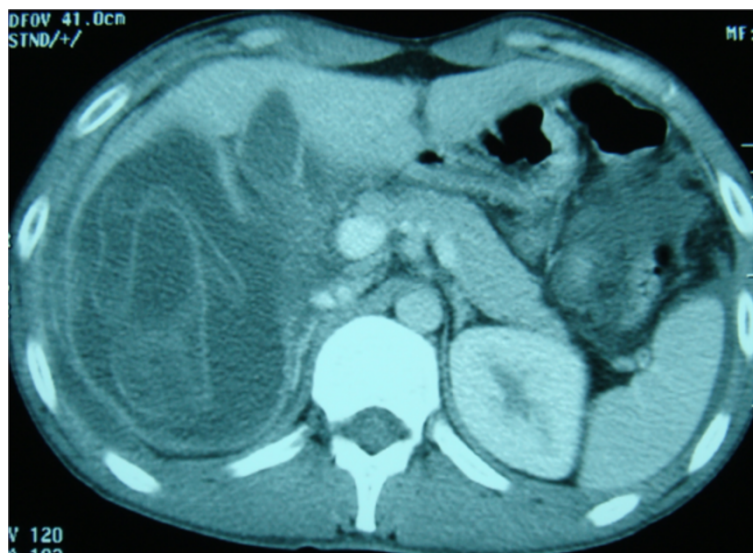
Figure 2 Axial contrast enhanced computed tomography images demonstrate ruptured hydatid lesion within right liver lobe.

to five liters of hydatid fluid with floating daughter cysts and purulent material was present in the abdomen (Figure 5). Partial pericystectomy and drainage was the most frequent surgical procedure. In two patient, there was direct communication between the cyst and the gall-bladder, and cholecystectomy was performed. Procedures to fill the cystic cavities were applied after removal of the