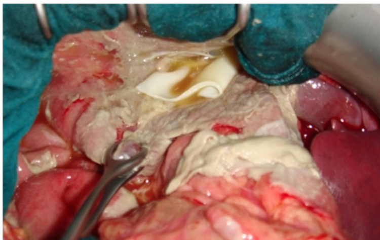
Figure 5 Intraoperative appearance of a cyst in the abdomen.

intraperitoneal fluid. Unroofing the cyst, capitonnage and external drainage in all patients, omentoplasty in two patients, were the methods used to manage the cysts. Four patients had two or more of these procedures. No patients died in the early postoperative period. A total of seven complications developed in six patients. biliary fistula developed in two patients. Other complications were prolonged ileus, pulmonary infection, and wound infection, one each. Biliary fistula closed spontaneously in tow of the fistula patients. Sites of the primary cysts, surgical procedures, and postoperative morbidities are shown in Table 2.