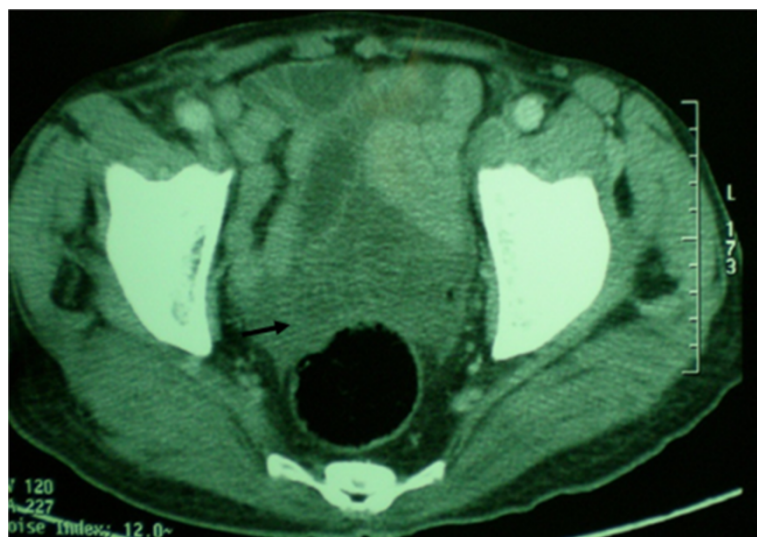
Figure 4 Axial contrast enhanced computed tomography images demonstrate ruptured hydatid lesion with free serous pelvic fluid.