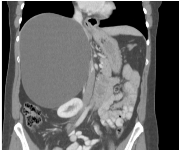
Figure 1 CT scan showing the 20 x 14 cm simple liver cyst.

never been reported in the literature review. It's the originality of our case.