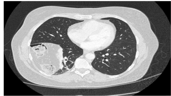
Figure 3 CT scan Transversal computed tomography (CT) showing the loop of colon in the right-sided diaphragmatic hernia.

donor liver transplant [12,13]. Mostly, this complication has been known to develop after esophagectomy and nephrectomy [14-17] (Table 1).