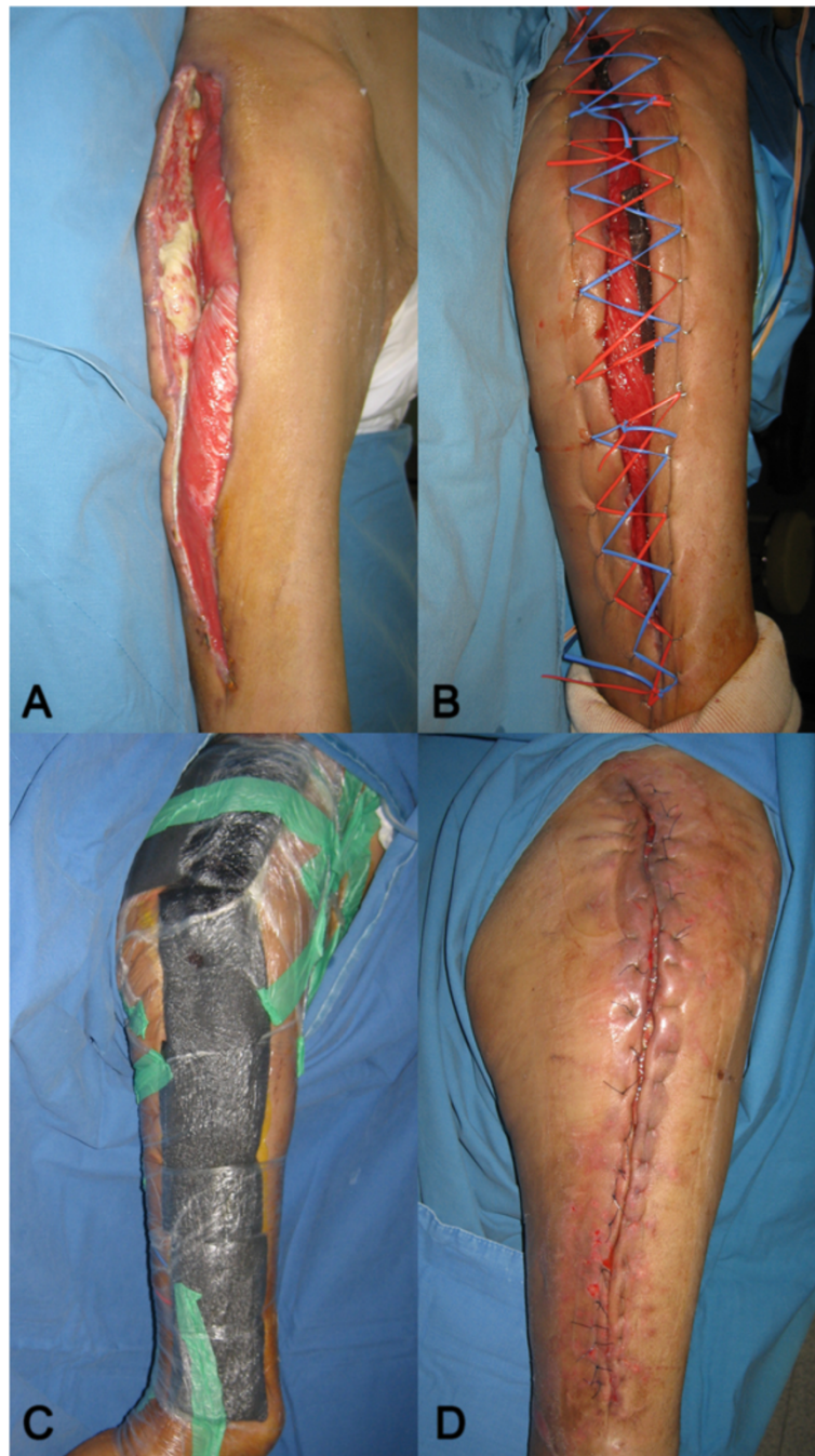
Figure 1 Open fasciotomy wound closure with extended NPWT-assisted dermatotraction in necrotizing fasciitis; A 59-year-old male patient with necrotizing fasciitis on his right thigh showed contracted skin margins with necrotic tissues on the 14th day after initial fasciotomy. (A). After 46 days of wound preparation, the elastic vessel loop is applied for the dermatotraction in a shoelace manner (B). The extended NPWT assisted the underlying dermatotraction in closing the open fasciotomy wound (C). After the 14 days of treatment, the fasciotomy wound could be closed directly (D).

darkens as the necrosis develops with bullae formation. Occasionally, tissue crepitus may be palpable during the course of the disease. Because the diagnosis is based primarily on clinical findings, early diagnosis of the necrotizing fasciitis is challenging [15]. Necrotizing fasciitis