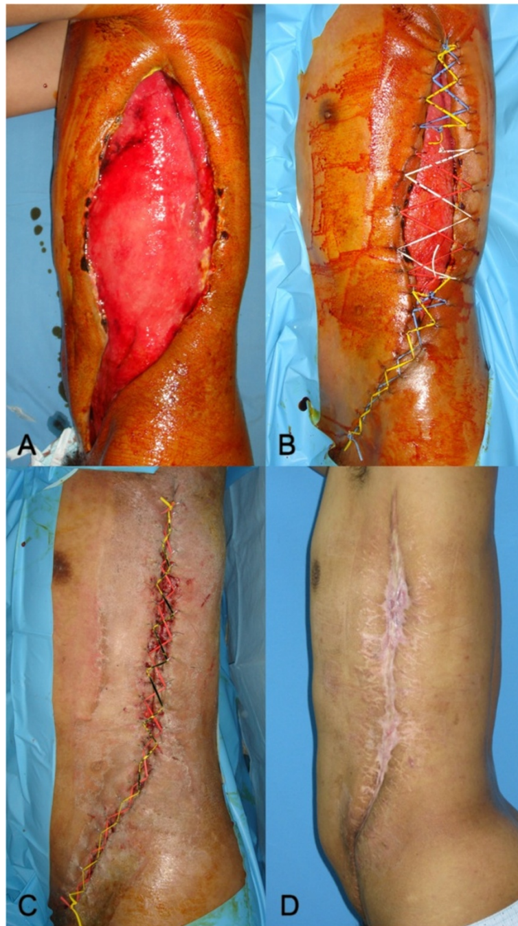
Figure 3 Open fasciotomy wound closure with extended NPWT-assisted dermatotraction in necrotizing fasciitis; A 43-year-old male patient with necrotizing fasciitis that had developed an abscess in the left axilla underwent open fasciotomy one month before presentation. (A). After 40 days of wound preparation since initial fasciotomy, the patient underwent NPWT-assisted dermatotraction, which decreased the size of wound prominently after 6 days of treatment (B). The wound was closed directly after 40 days of NPWT assisted dermatotraction (C). The patient was followed up for 27 months and the wound was completely healed without complications (D).

These comorbid patients are apt to progress into severe infection or sepsis without coverage of the open wound.