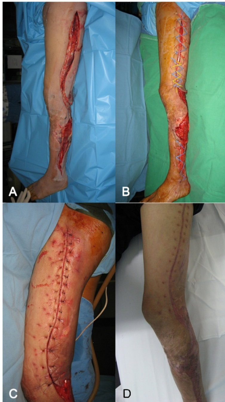
Figure 2 Open fasciotomy wound closure with extended NPWT-assisted dermatotraction in necrotizing fasciitis; A 62-year-old male patient with necrotizing fasciitis on the left lower extremity underwent open fasciotomy on his thigh and lower leg. (A). After 7 days of thorough wound debridement and preparation, extended NPWT-assisted dermatotraction was applied (B). After two cycles of treatment, the fasciotomy wounds were closed directly, and the posterior calf's raw surface was covered with split-thickness skin graft (C). Three months after wound closure, the wounds were completely healed without complications (D).

lack of resistance to blunt dissection, lack of bleeding of the fascia, and the presence of foul odor with pus [16]. Because necrotic fascia involvements are usually more widespread than the skin lesion, the surgical debridement must be extended to the viable tissue layers