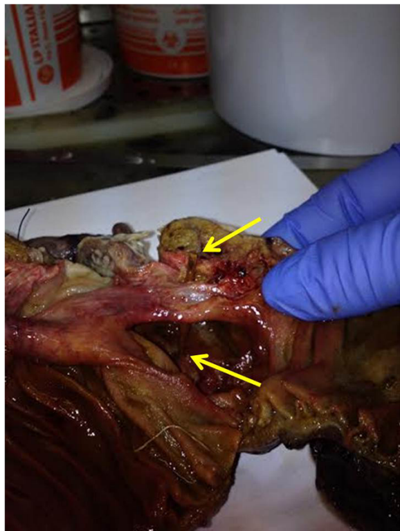
Figure 2 Operative specimen showing the toothpick (arrows) and the site of transmural cecal perforation.

A recent Medline literature research identified 136 case reports of ingested toothpicks [3]. Male gender, toothpick chewing habit, meals containing toothpicks and accompanied by alcoholic drinks were the main risk factors associated with toothpick ingestion. Most of the toothpicks were swallowed during meal time. Perforation of the alimentary tract occurred in 80% of these patients (Table 1);